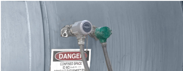
Installation of new DynaCHARGE™ particulate sensor (left) for filter leak detection by row.

FilterSense’s DynaCHARGE particulate monitors employ charge induction sensing and fully insulated sensing probes to enable reliable operation with conductive particulate, corrosives, and moisture. The plant experienced recurring false alarms from triboelectric sensors and electronic failures from poor quality. These issues took valuable time away from core operations.