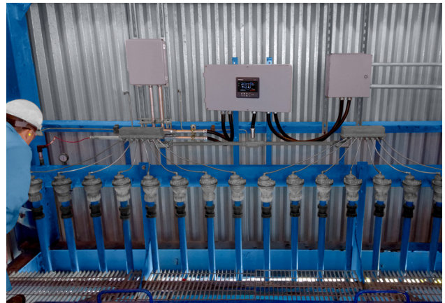
FilterSense engineer inspecting B-PAC function (center) and pulse valves (below).

B-PAC controls provide real-time diagnostics to detect/locate failed solenoids and pulse valves. At start-up the B-PAC on the dross process quickly identified failed solenoids in rows 4, 47, and 49, avoiding catastrophic filter failure, emissions, and unexpected shutdown. Intelligent DP control keeps the baghouse optimized.