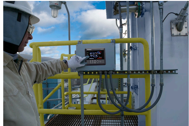
Operators access control and diagnostic functions from the B-PAC™ control units at the process, or remotely using FilterWARE™.

FilterWARE provides centralized analysis and control of 120 baghouses spread over 300 acres. Maintenance is deployed proactively to prevent downtime. FilterWARE logs data, work orders, and corrective actions, and generates EPA, process, and maintenance reports. The result is improved production with countless man hours saved – the plant estimated savings equal to 2 persons, full time, 7 days a week.