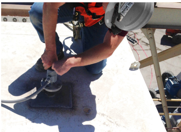
FilterSense engineer commissioning particulate sensor.

Diagnostic Screen: Filter leakage, failed solenoids, and valves by row.