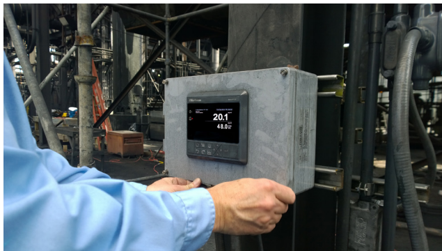
FilterSense engineer commissioning DynaCHARGE™ PM 100 PRO.

Unlike FilterSense, other sensors required monthly to quarterly cleaning, sometimes weekly!